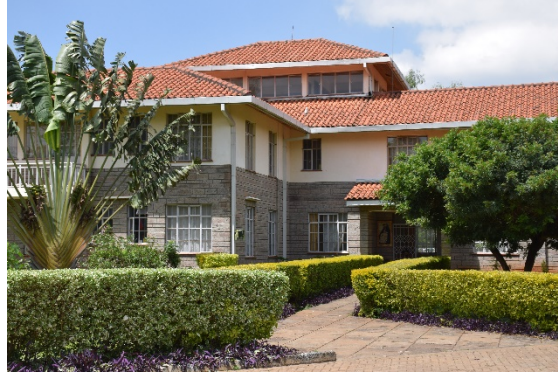
St. Dominic's priory.