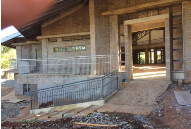
The new rooms added.