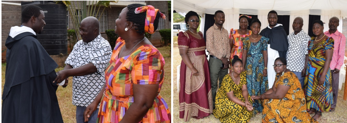
His parents and family.