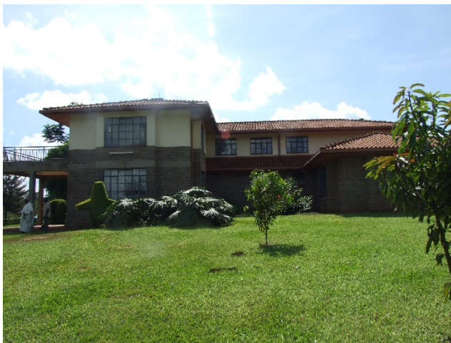
St. Catherine of Siena House