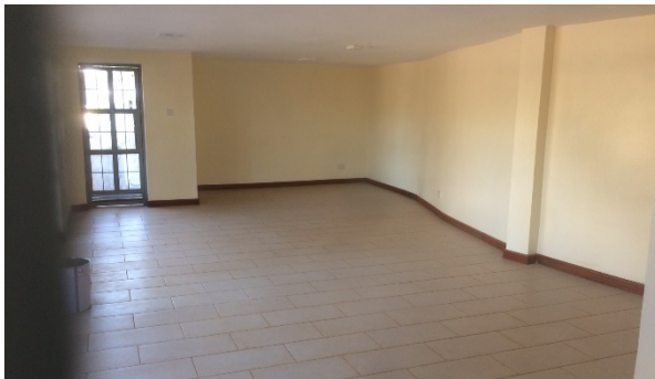
Interior space of one of the ministry rooms.