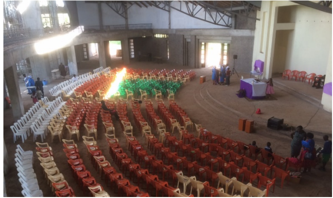
The interior worship space, set-up for Mass and a fundraising event (Harambee).